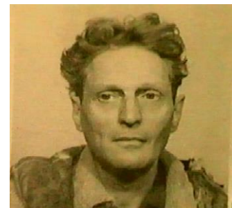
Mug-shot of Late Reverend Richard Wurmbrand when held in the Jilava prison, in communist Romania.