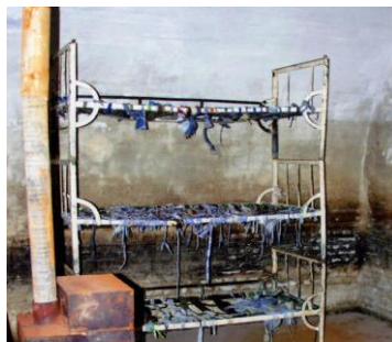
Prison cell with bunkbeds with no mattress, prisoners were obliged to sleep on. Stove for show only, never heated in cold winters.