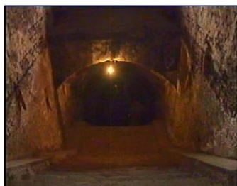
The Communist Jilava Prison. Entrance to the underground cells.

Demonic forces are at work. Let us pray unceasingly against them. The Bible saith that the Son of Perdition will sit in the temple of God. (II Thessalonians 2:3-4) Not to expose him means not to fulfill your duty toward the sincere but naive worshippers. We ask Christians in the Free World to fight against communist infiltration in churches. Fight the infiltration of communist, atheistic ideas among young people. In one of the rallies a radical communist student said: “I am rebelling against the American way-of-life. I asked my father what life is? He answered that to live means to study, to get a job, to grow old and retire and then to die. I find such a life stupid.” We need tell this young generation about Christ whose disciples will resurrect!