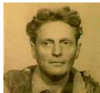
Mug-shot of Late Reverend Richard Wurmbrand when held in the Jilava prison, in communist Romania.